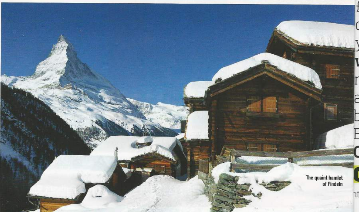
The quaint hamlet of Findeln